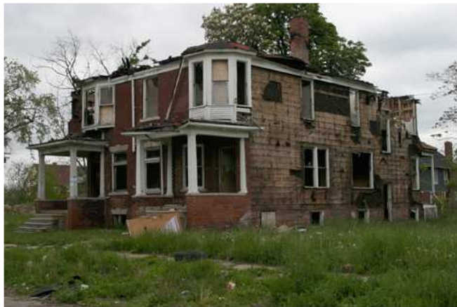
Abandoned house on Detroit's east side